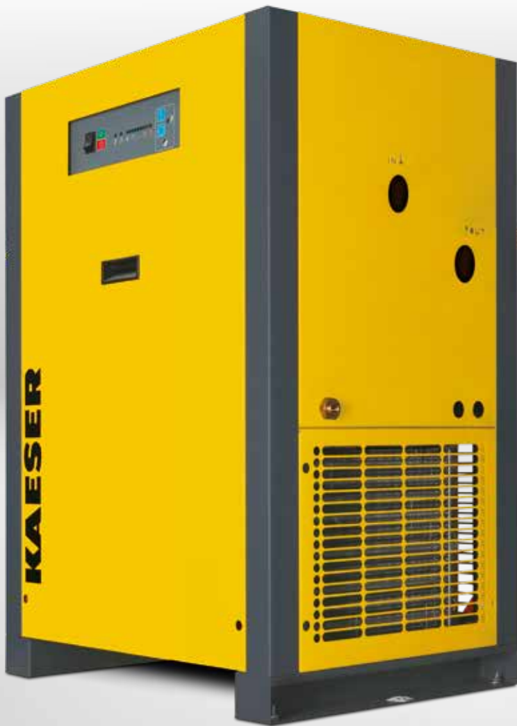
Standard version THP 40-50